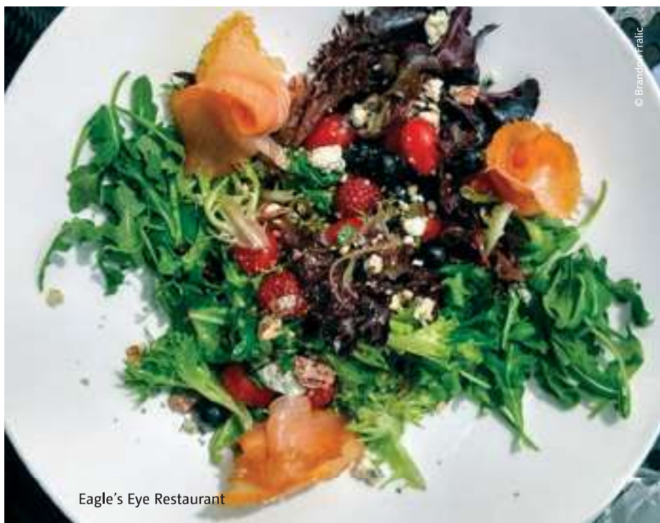
Eagle's Eye Restaurant

bridge before reaching the Captain's dock. An oasis awaits, complete with the Canadian flag hoisted high.