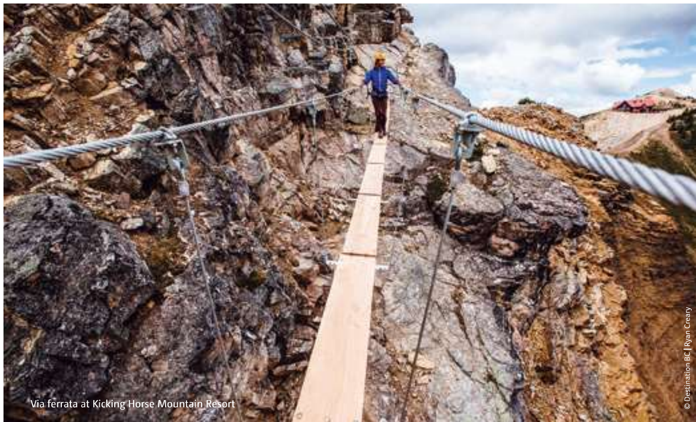
Via ferrata at Kicking Horse Mountain Resort

Once you've checked in and checked out your digs, head downtown to get acquainted with Golden. A noteworthy first stop is Golden's only brewery, Whitetooth Brewing.